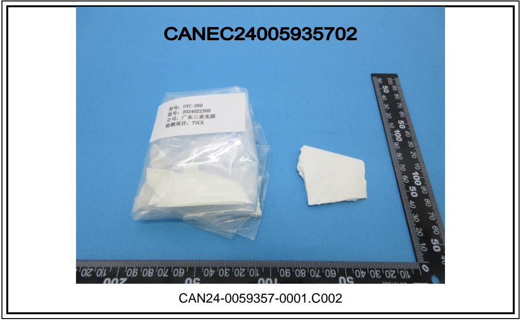
SGS authenticate the photo on original report only *** End of Report ***